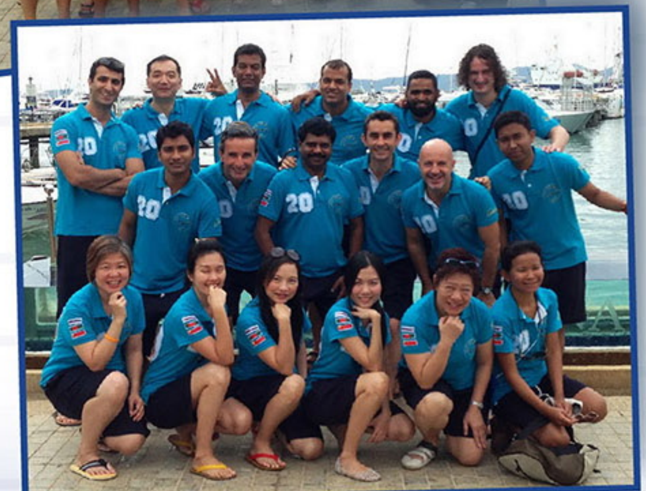
Incentive Trip - Phuket - 2013